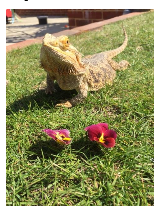
Fig 4. Merlin enjoying the outside and some pansies.

Further adjustments to her environment and routine include moving furniture round in her Vivarium, giving her a tray of sand to dig in, coming out side regularly (weather permitting), and feeding many more flowers and weeds from the garden.