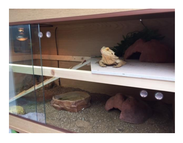
Fig 3. New level and ramp in Merlin's vivarium.

It is worth a mention too, that when I first received Merlin from the RSPCA she was not very mobile and her balance was poor. Since being out more she is much more mobile, falls over less and is able to climb.