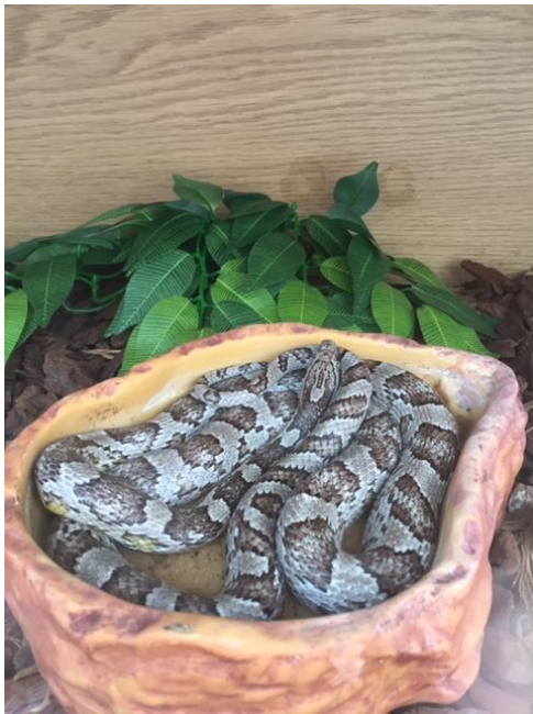
Fig 1. Pebbles taking a bath.

Before we start I have some sad news to share. Last week we had to say goodbye to pebbles the corn snake. She was a rescue from the RSPCA so we suspect she may be an older snake. It was a pleasure to have had her for her final 6 months of her life.