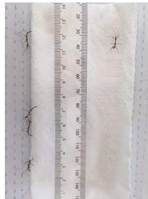
Fig 4. Nymphs less than 2 days old.

With the warm weather the first stick hatched in June!