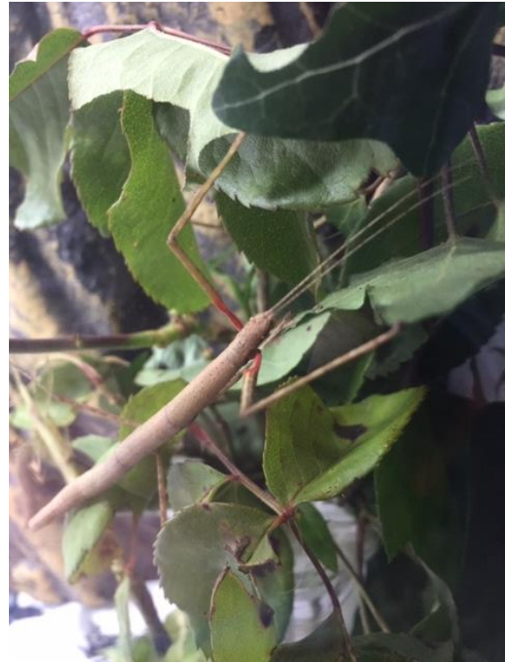
Fig 2. Adult Stick Insect

The children quickly became fascinated and enjoyed interacting with them.