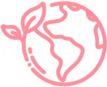
Fight climate change