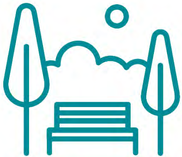
Green spaces for all