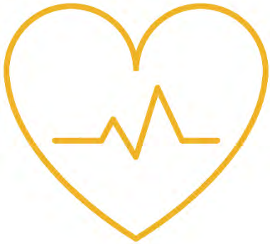
Health and wellbeing